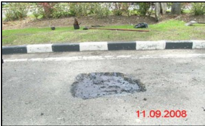
Film Batch : L9-15-137