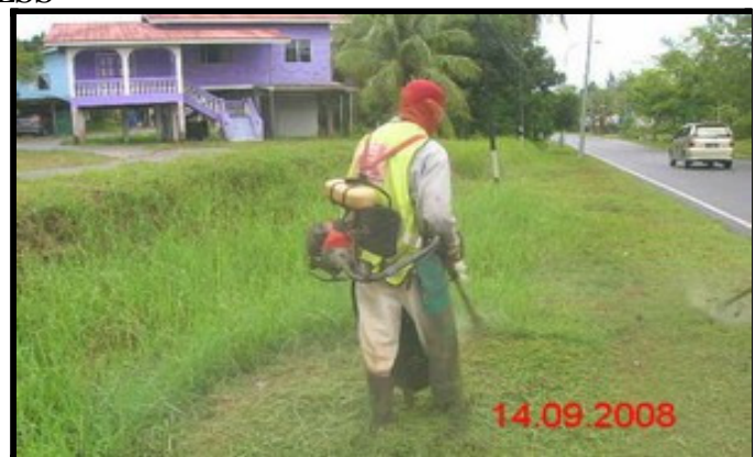
Film Batch : L5-24-014