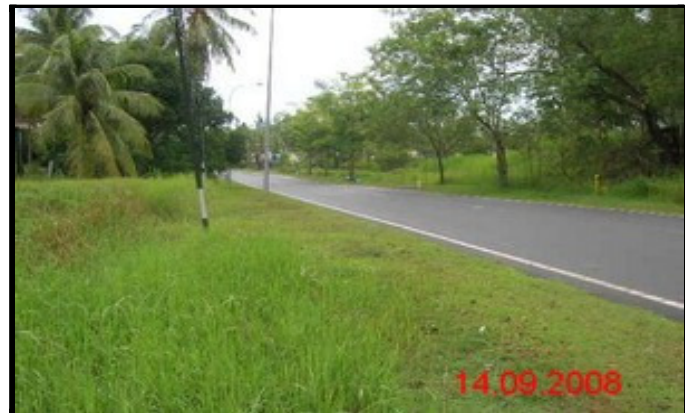
Film Batch : L5-24-011