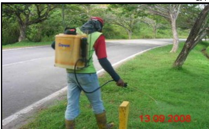
Film Batch : L5-18-004