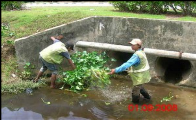
Film Batch : L9-12-011