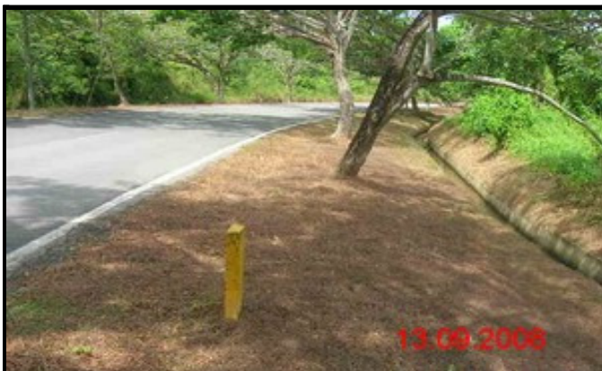
Film Batch : L5-19-035