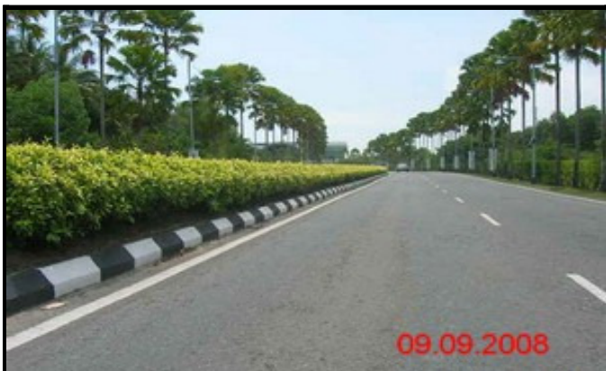
Film Batch : L5-11-032