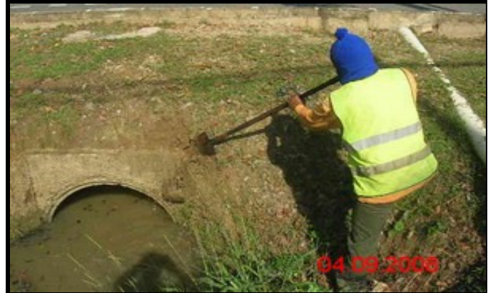
Film Batch : L5-31-028