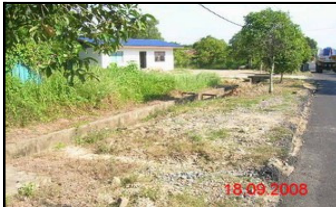
Film Batch: L9-15-190