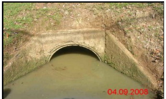
Film Batch : L5-31-033