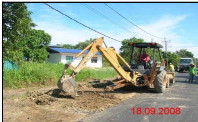
Film Batch: L9-15-194