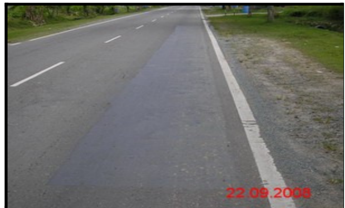
Film Batch : L10-02-058