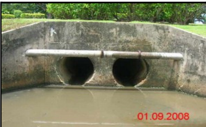
Film Batch : L9-12-017