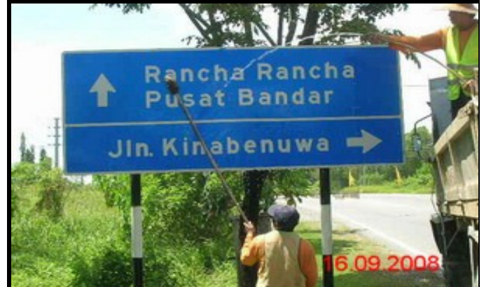
Film Batch : L9-13-082