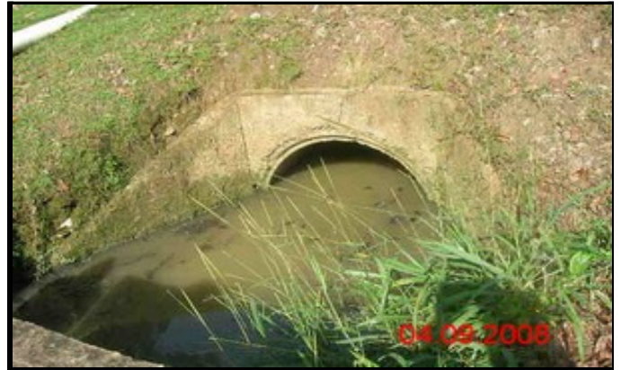
Film Batch : L5-31-025