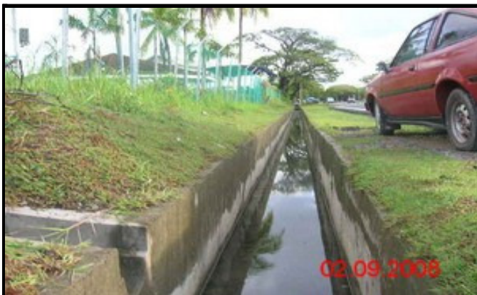
Film Batch : L5-19-044