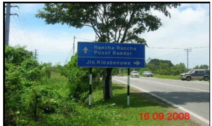
Film Batch : L9-13-088