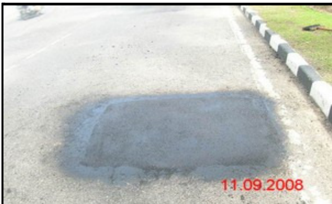
Film Batch : L9-15-163