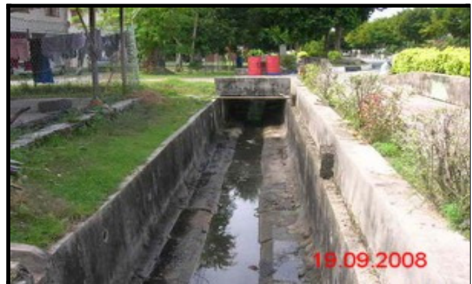
Film Batch : L5-27-033