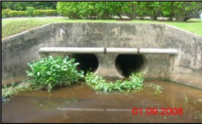
Film Batch : L9-12-005