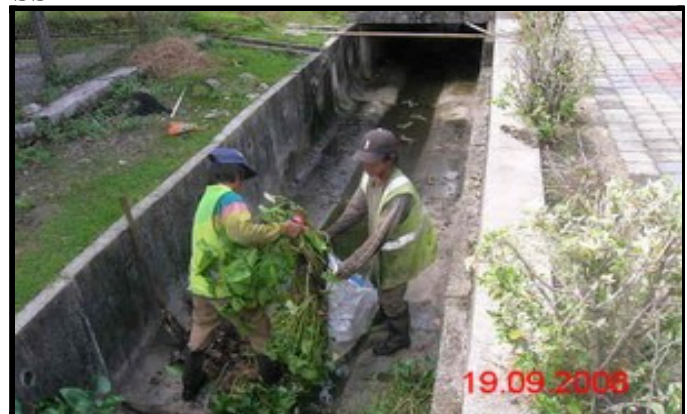
Film Batch : L5-27-029