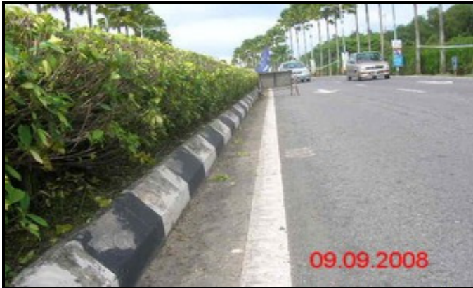
Film Batch : L3-03-064