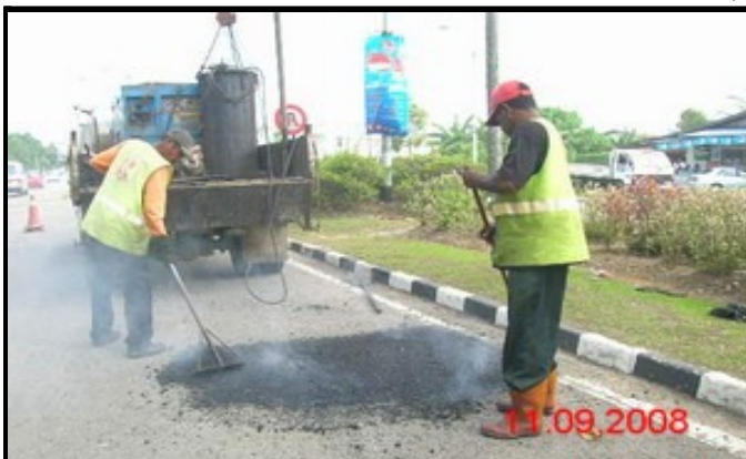
Film Batch : L9-15-143