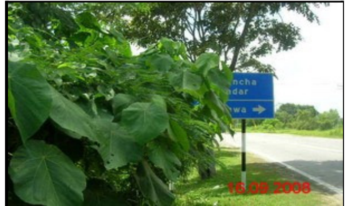
Film Batch : L9-13-074