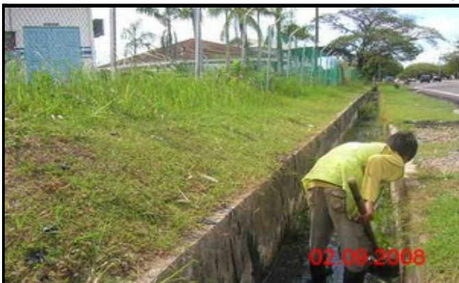
Film Batch : L5-19-040