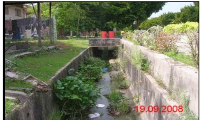
Film Batch : L5-27-024