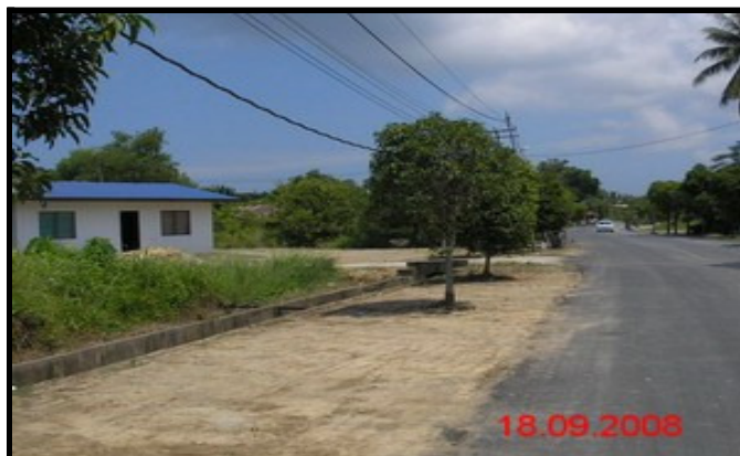
Film Batch: L9-17-072