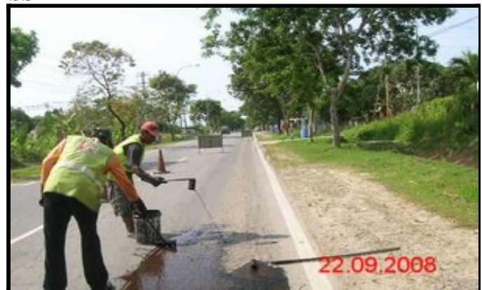
Film Batch : L9-15-168