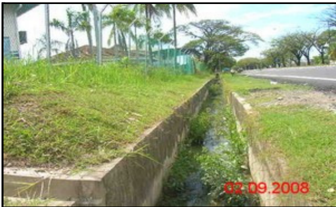
Film Batch : L5-19-036