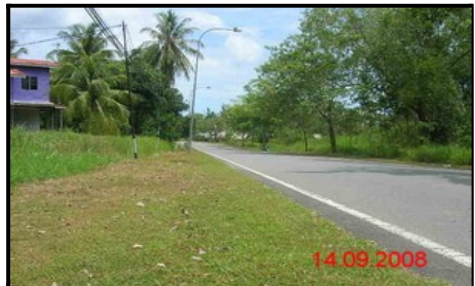
Film Batch : L5-24-030