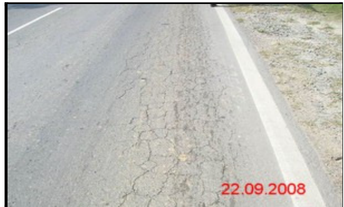
Film Batch : L9-15-165