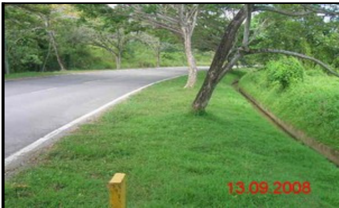
Film Batch : L5-18-003