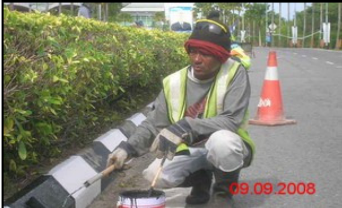
Film Batch : L3-03-070