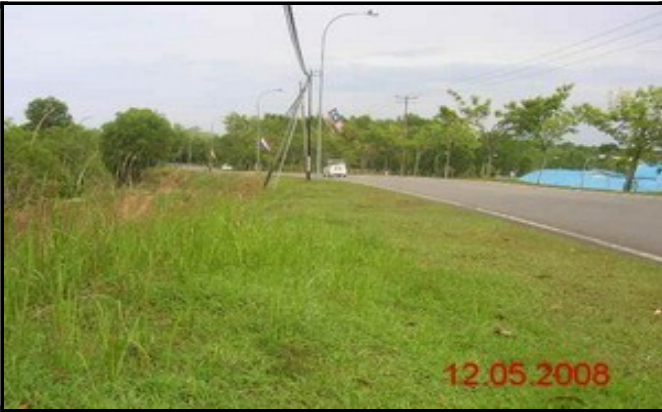
Film Batch : L5-06-001