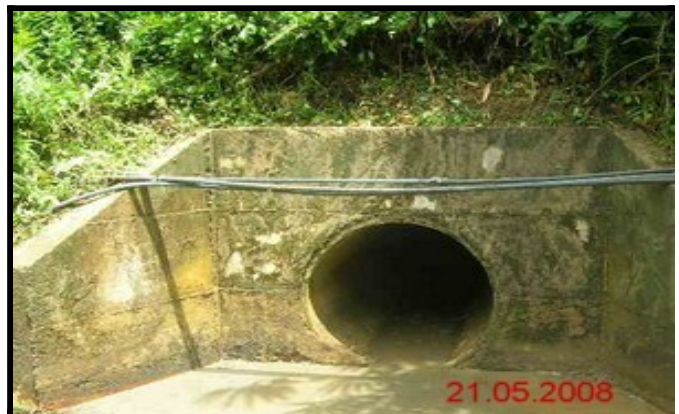
Film Batch : L5-09-026