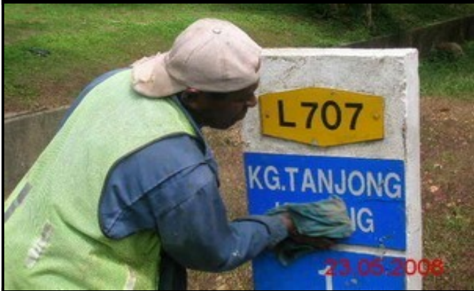
Film Batch : L5-12-034