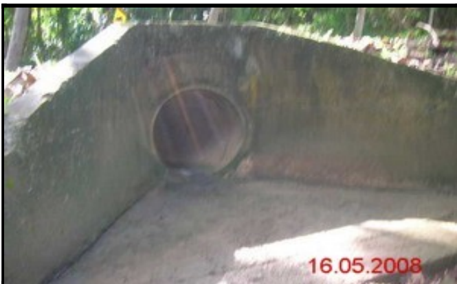
Film Batch : L5-09-041