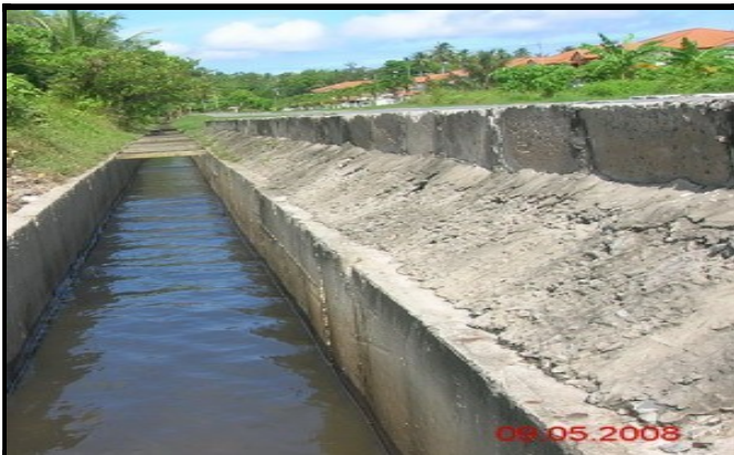
Film Batch : L4-14-001