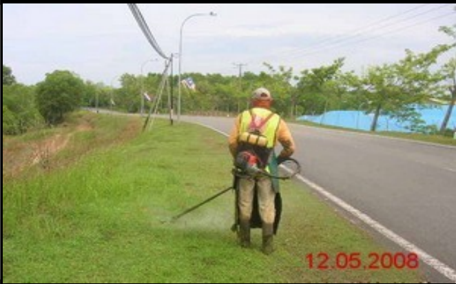
Film Batch : L5-06-002