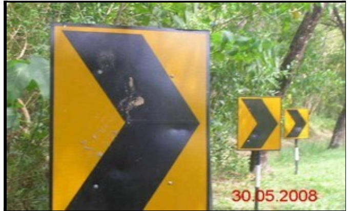
Film Batch : L5-12-085