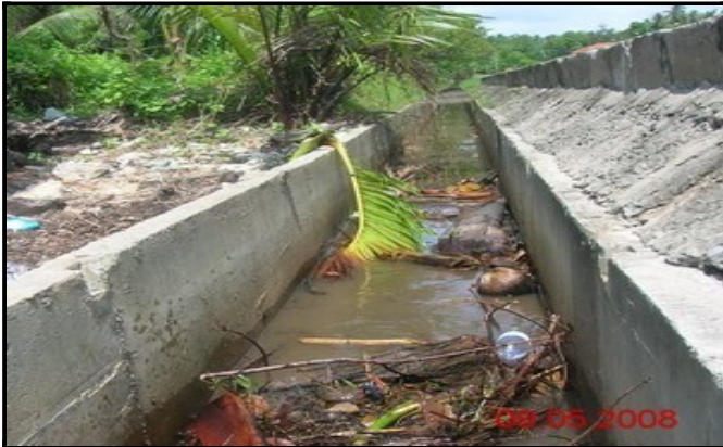
Film Batch : L4-12-028