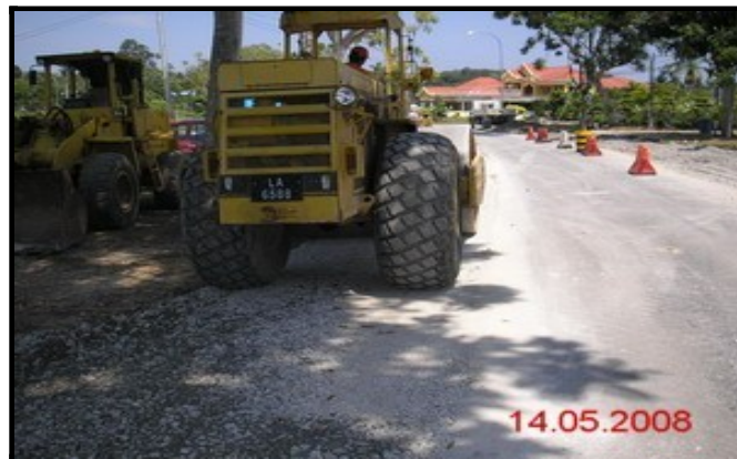
Film Batch: L5-15-026