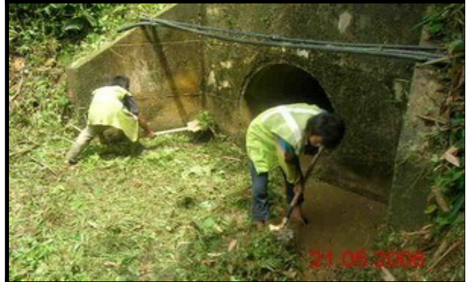
Film Batch : L5-09-021