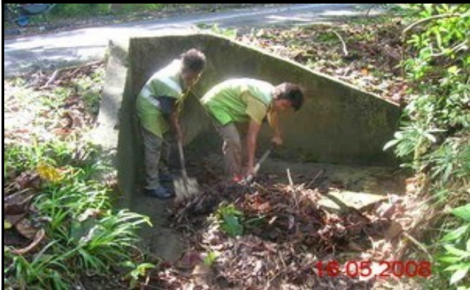
Film Batch : L5-09-039