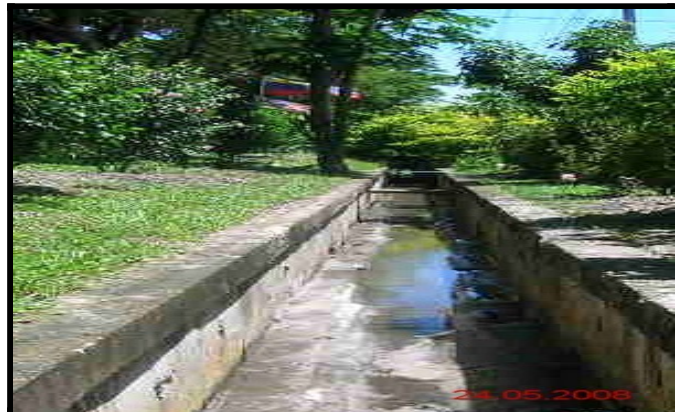
Film Batch : L4-14-042