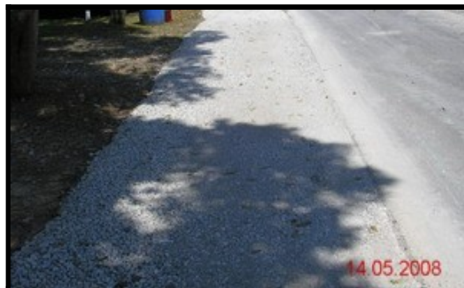
Film Batch: L5-15-029