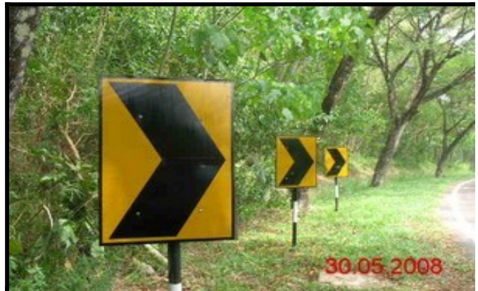
Film Batch : L5-12-096