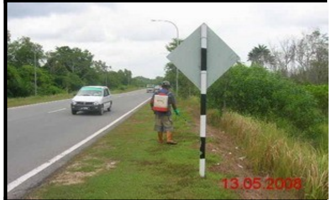
Film Batch : L5-09-052