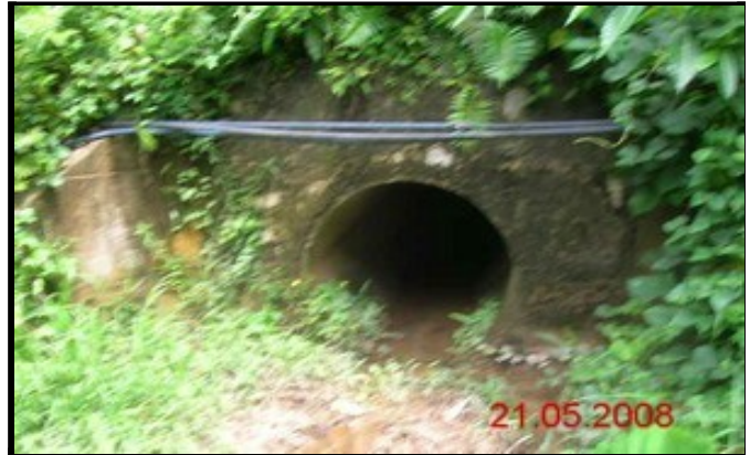
Film Batch : L5-09-010