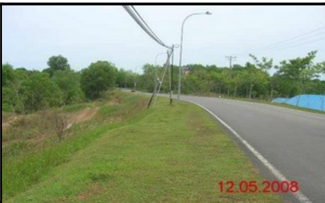
Film Batch : L5-06-027