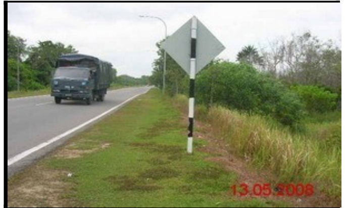
Film Batch : L5-09-049