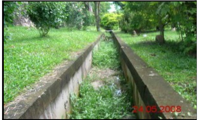
Film Batch : L4-14-036