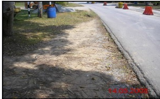
Film Batch: L5-15-012