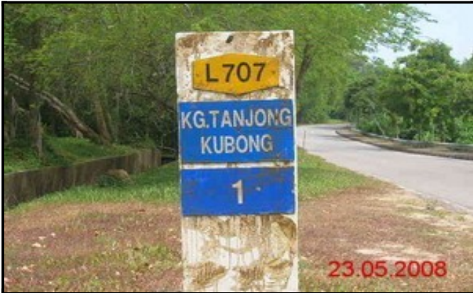
Film Batch : L5-12-031