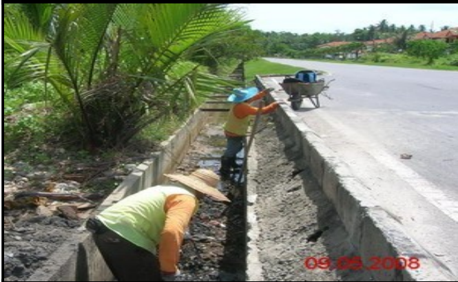
Film Batch : L4-12-029