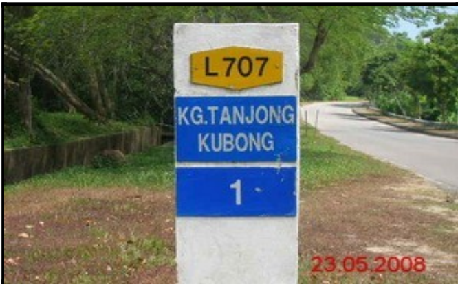
Film Batch : L5-12-039