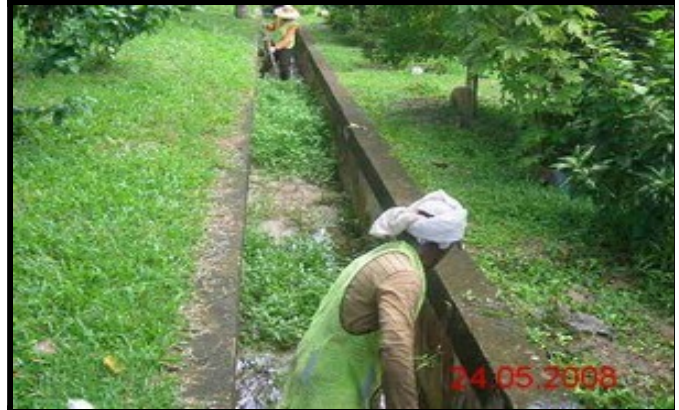
Film Batch : L4-14-037