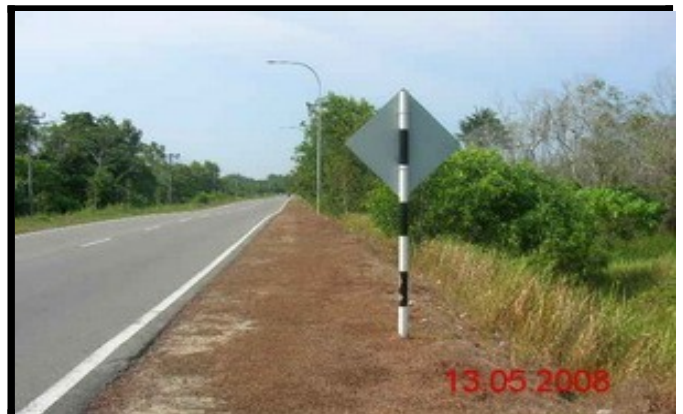
Film Batch : L5-12-147