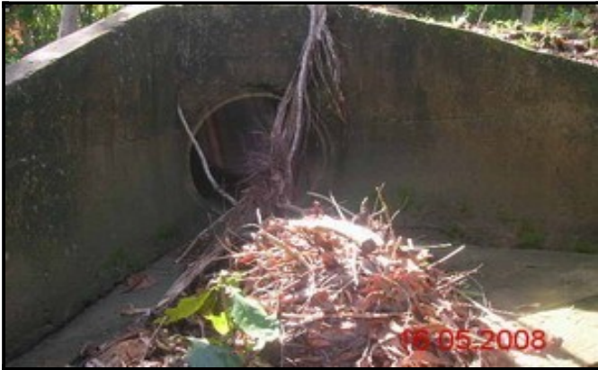
Film Batch : L5-09-033