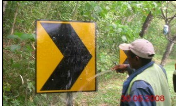
Film Batch : L5-12-091