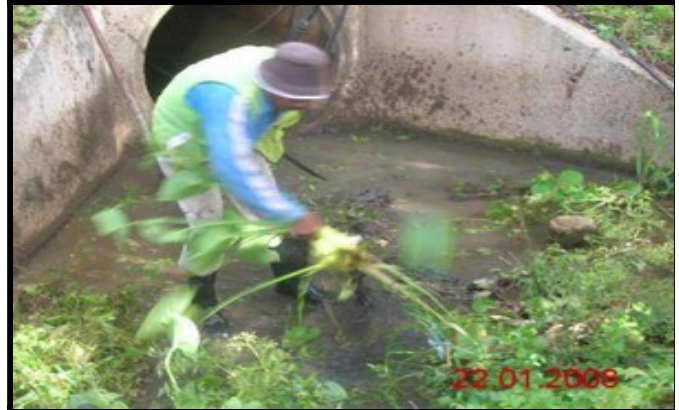
Film Batch : LL07-17-068