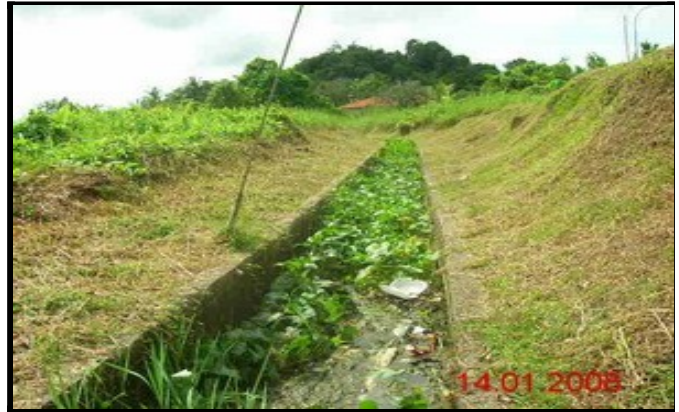
Film Batch : LL07-17-001