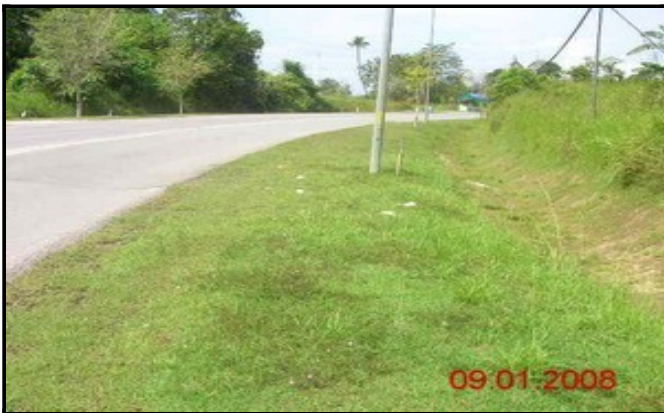
Film Batch : LL07-12-016