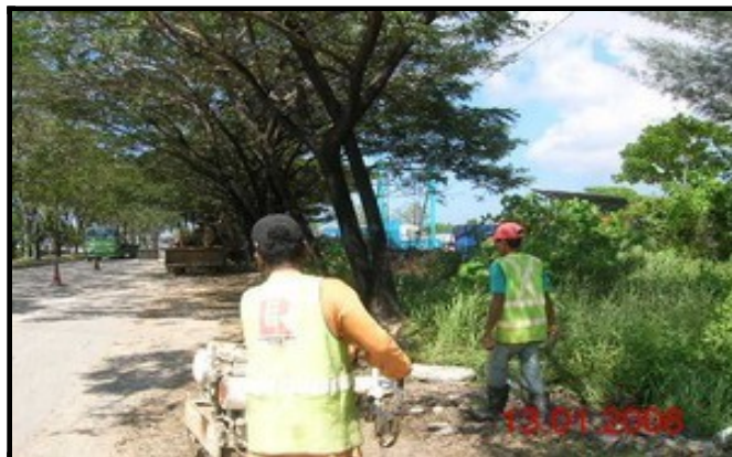
Film Batch: L1-10-010