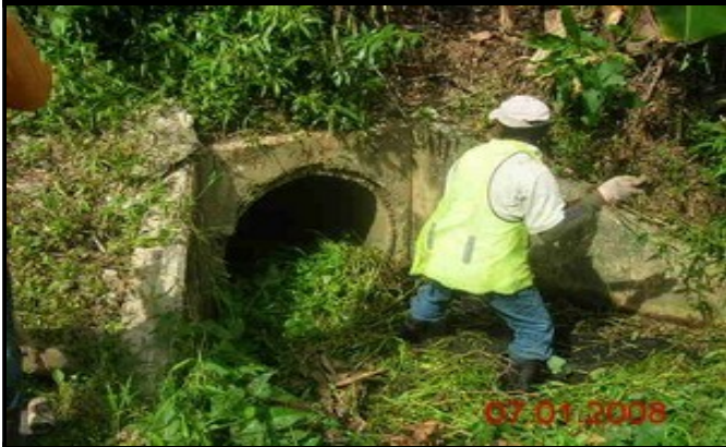
Film Batch : LL07-16-028