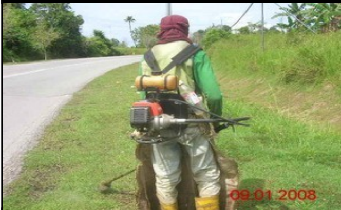
Film Batch : LL07-12-018