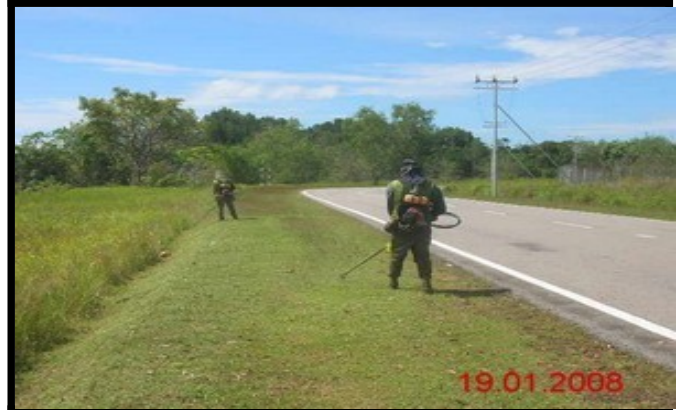
Film Batch : L1-03-012