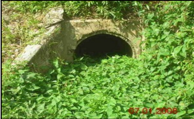
Film Batch : LL07-16-021