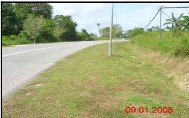
Film Batch : LL07-12-073