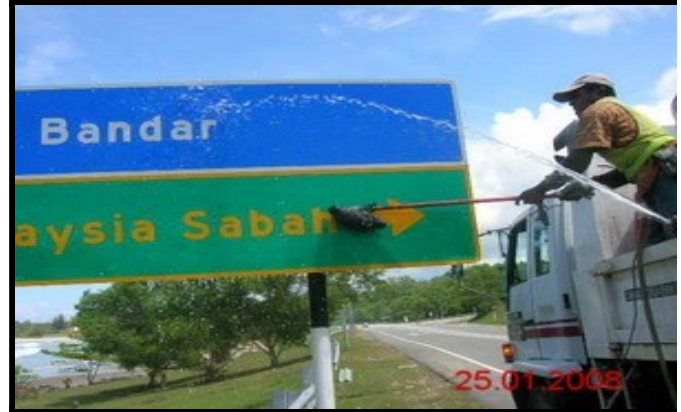
Film Batch : L1-06-166