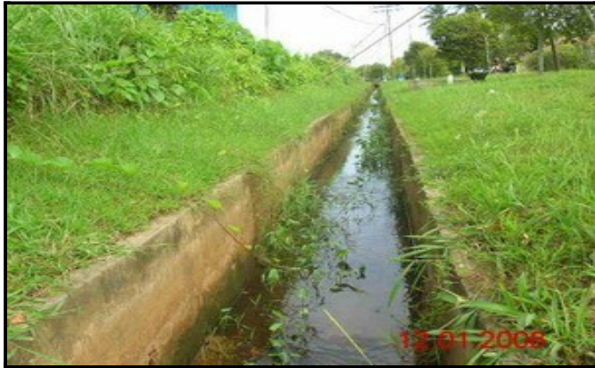
Film Batch : LL07-14-005