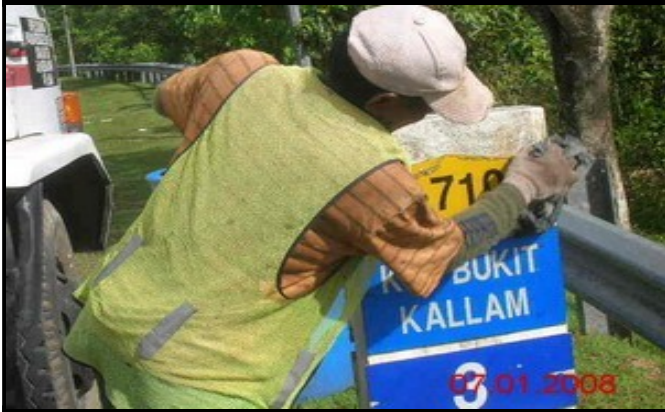
Film Batch : L1-06-069