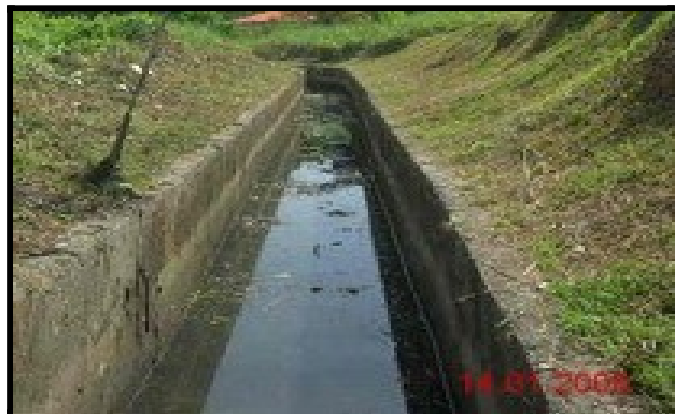
Film Batch : LL07-17-041