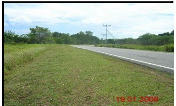
Film Batch : L1-03-038