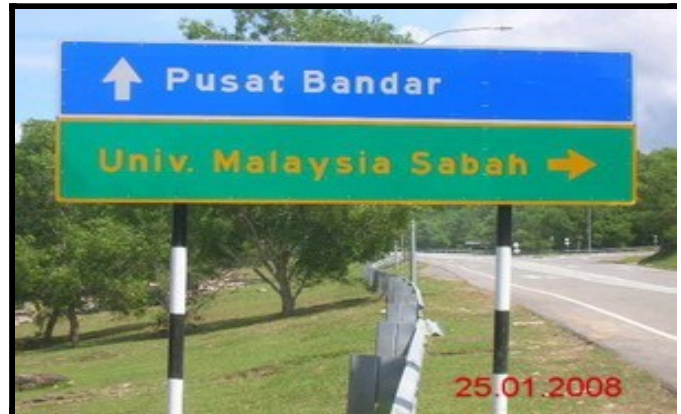
Film Batch : L1-06-147