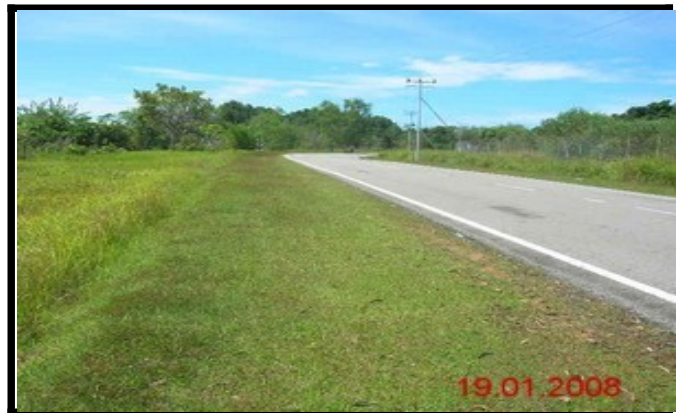
Film Batch : L1-03-007