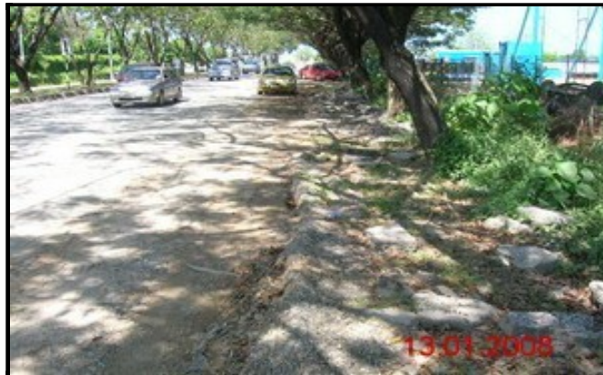
Film Batch: L1-10-002