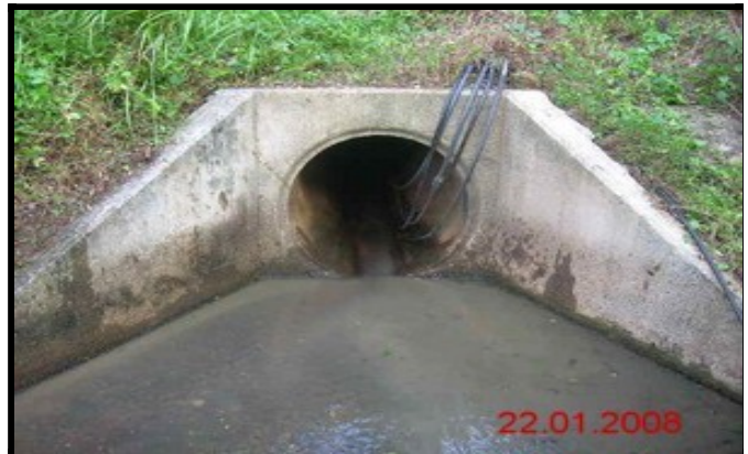
Film Batch : LL07-17-075