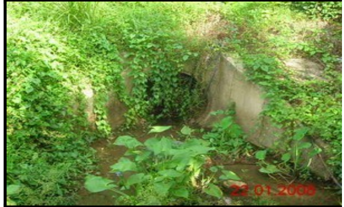
Film Batch : LL07-17-059