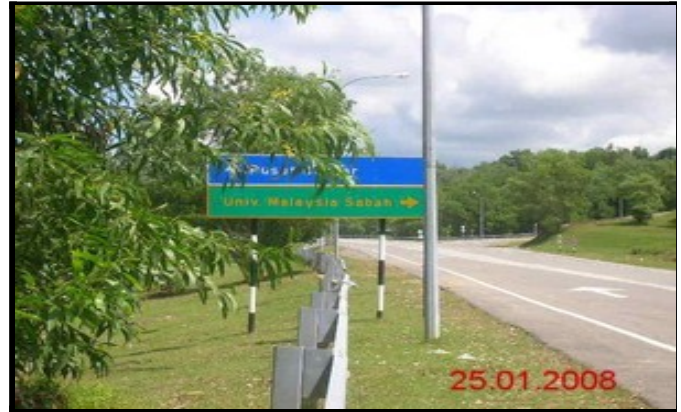
Film Batch : L1-06-147