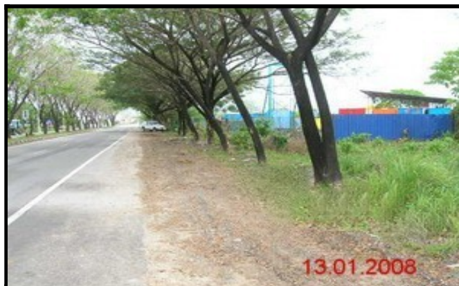
Film Batch: L2-05-033