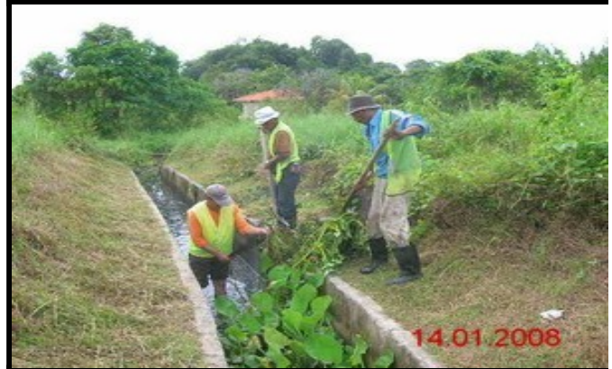
Film Batch : LL07-17-026