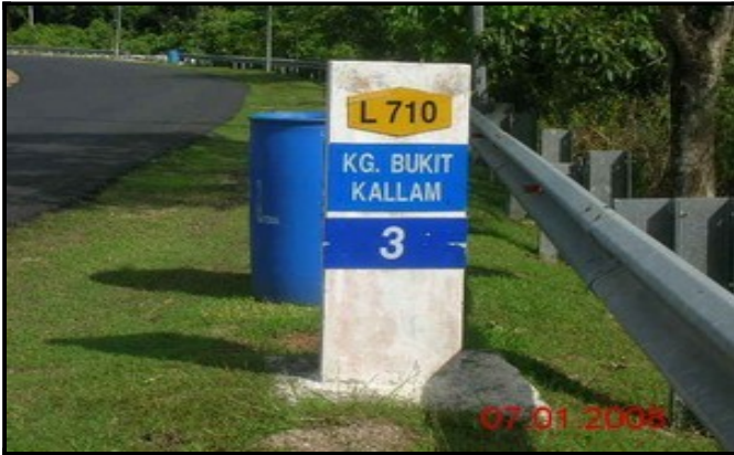
Film Batch : L1-06-066