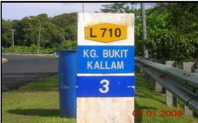
Film Batch : L1-06-069