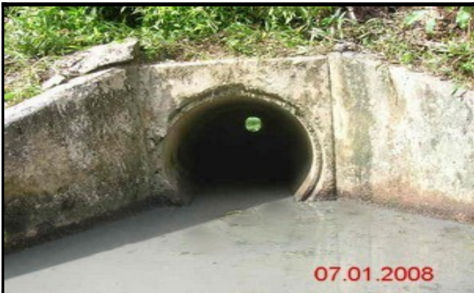
Film Batch : LL07-16-036