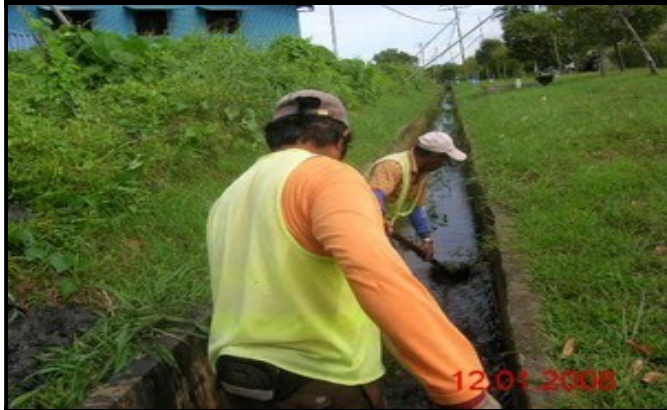
Film Batch : LL07-14-008