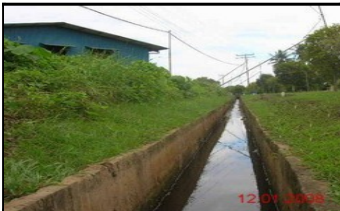
Film Batch : LL07-16-002