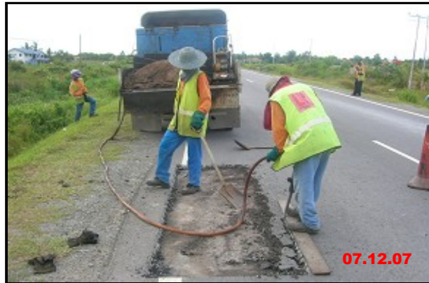
B E F O R E