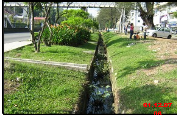
B E F O R E