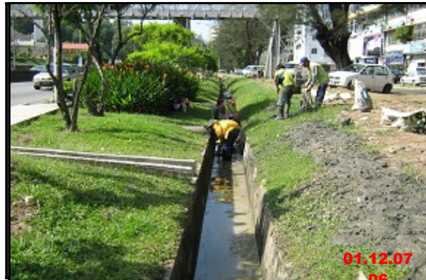
I N P R O G R E S S