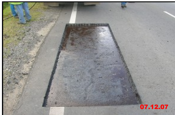
I N P R O G R E S S