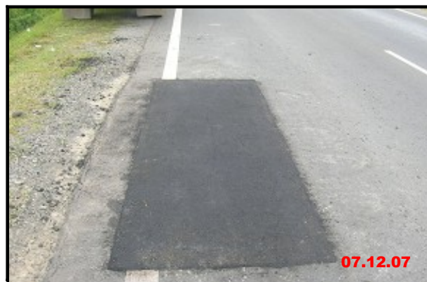
A F T E R