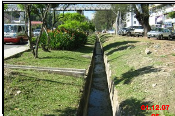
A F T E R