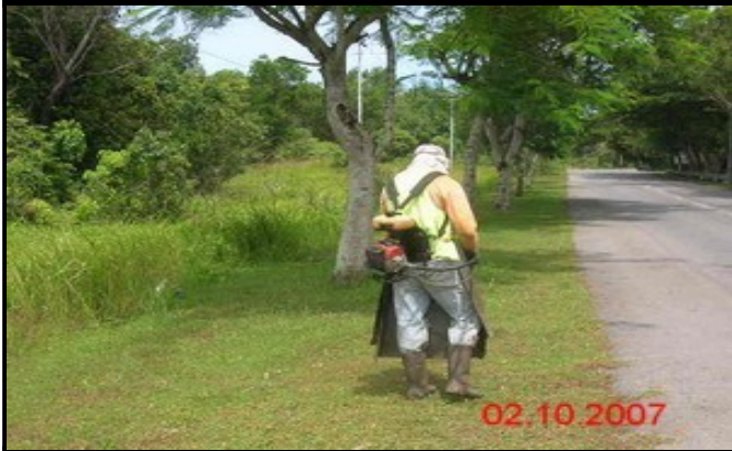
Film Batch : LH07-02-021