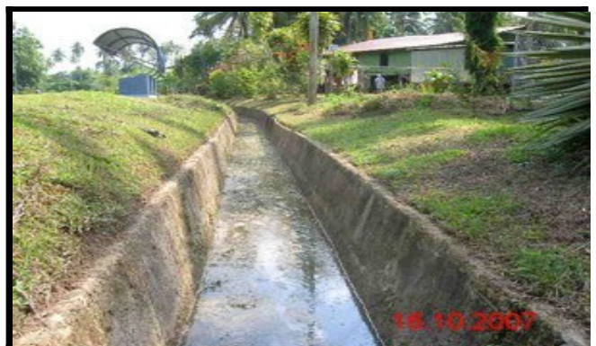
Film Batch : LJ07-04-078