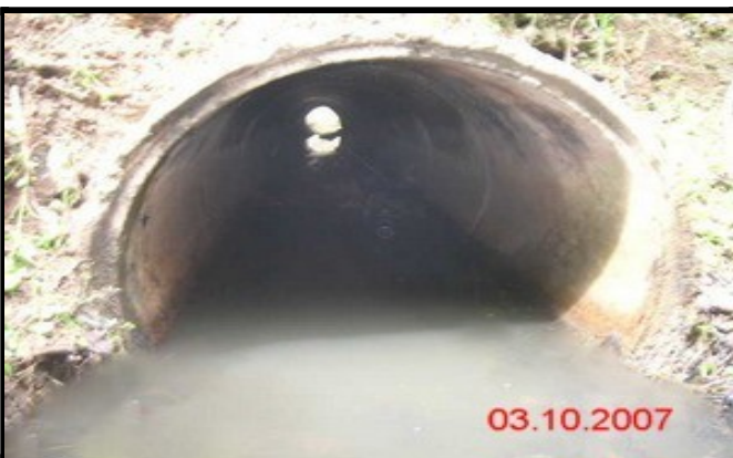
Film Batch : LJ07-06-026