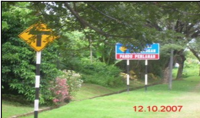
Film Batch : LJ07-06-052