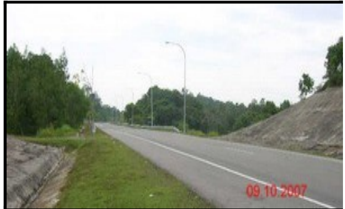
Film Batch : LI07-12-045