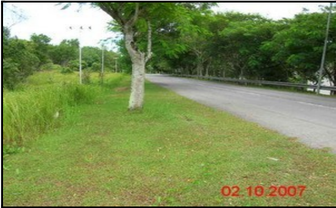
Film Batch : LH07-02-018