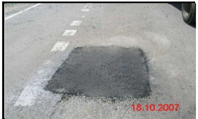
Film Batch : LJ07-10-045