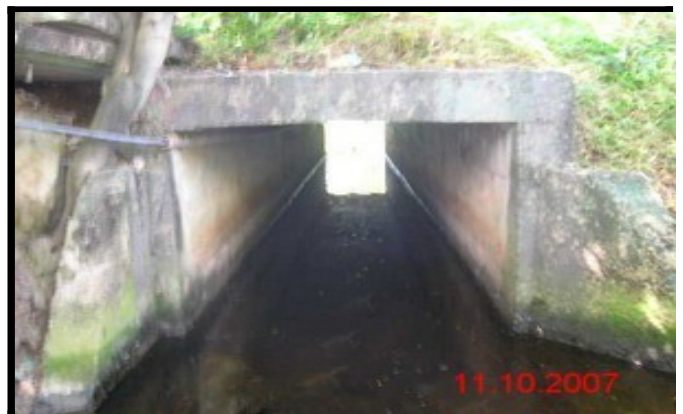
Film Batch : LI07-13-023