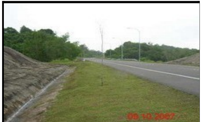
Film Batch : LI07-12-069