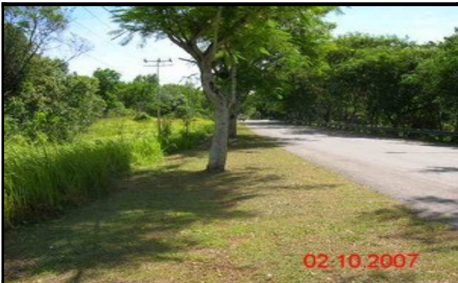
Film Batch : LH07-02-024