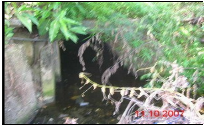
Film Batch : LI07-13-012