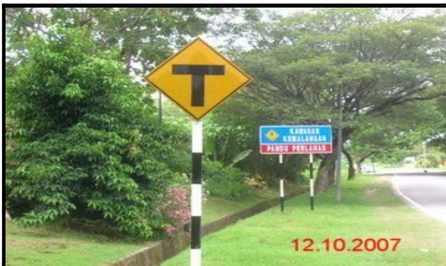
Film Batch : LJ07-06-004