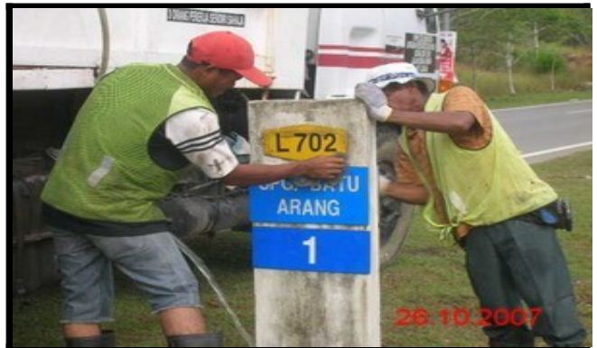
Film Batch : LJ07-06-155