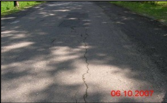
Film Batch : LJ07-10-006