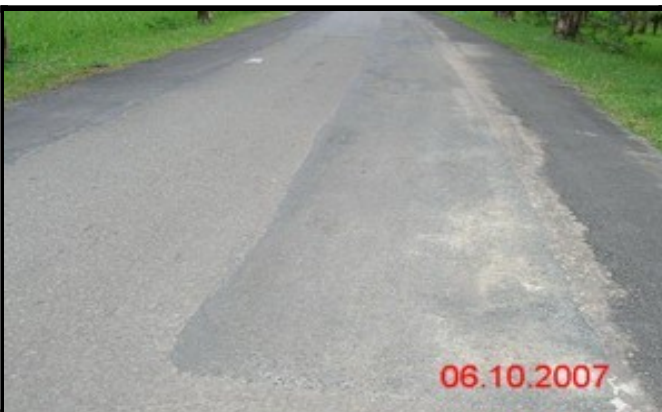
Film Batch : LK07-02-003