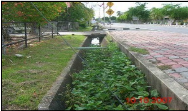
Film Batch : LI07-10-043