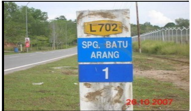
Film Batch : LJ07-06-102