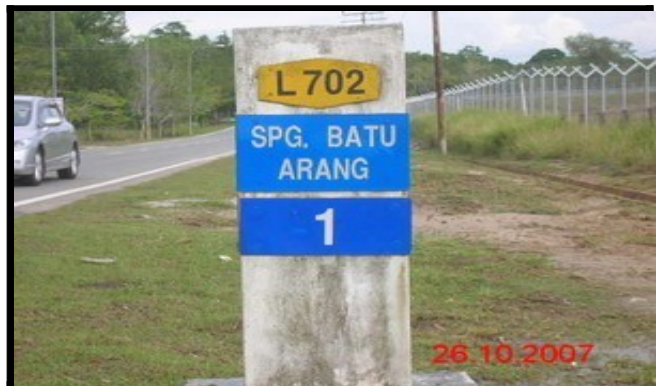
Film Batch : LJ07-06-150