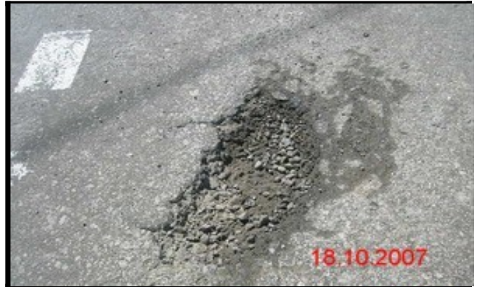
Film Batch : LJ07-10-028