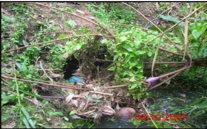
Film Batch : LI07-10-015