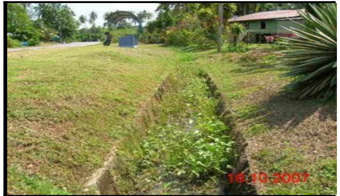
Film Batch : LJ07-04-046