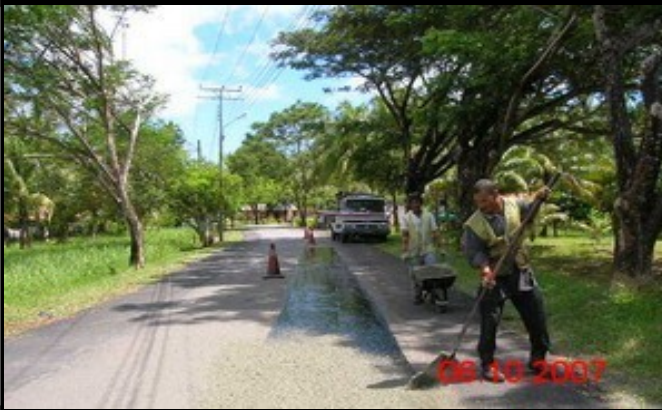
Film Batch : LJ07-10-013