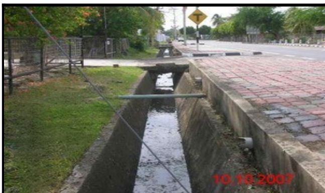
Film Batch : LI07-10-049