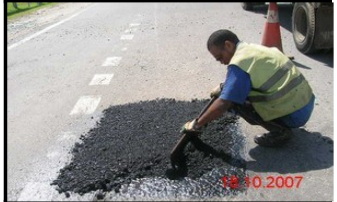
Film Batch : LJ07-10-040