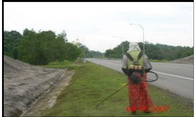
Film Batch : LI07-12-047