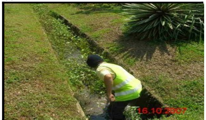
Film Batch : LJ07-04-048