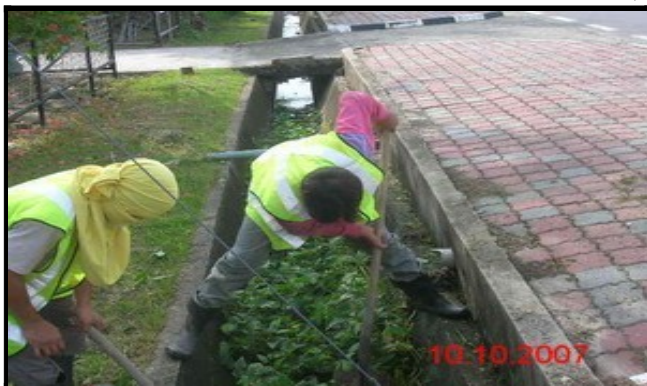
Film Batch : LI07-10-044