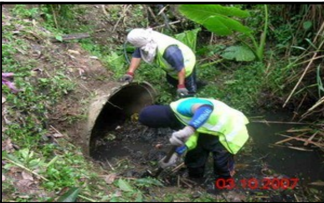
Film Batch : LI07-10-023