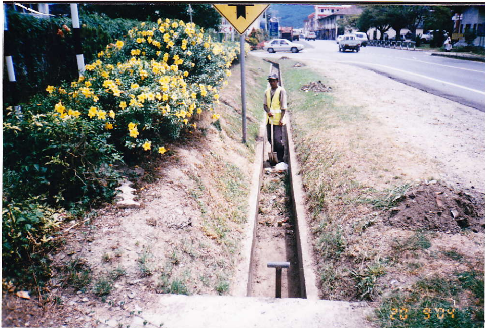
FILM BATCH NO: 1463/10