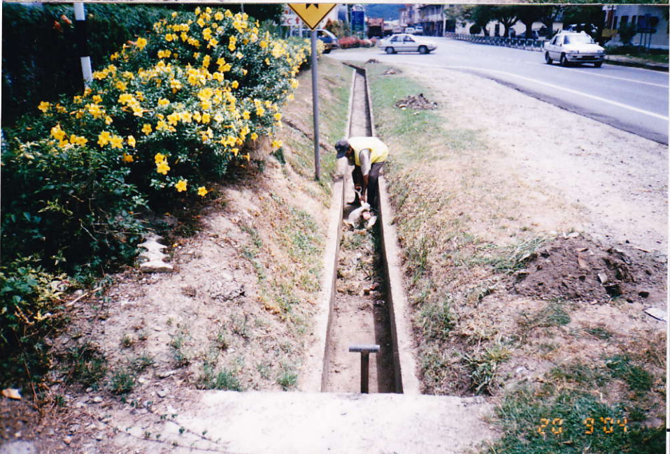
FILM BATCH NO: 1463/2