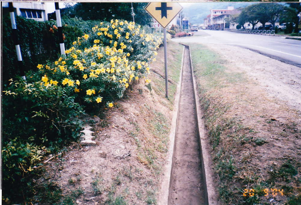
FILM BATCH NO: 1463/11