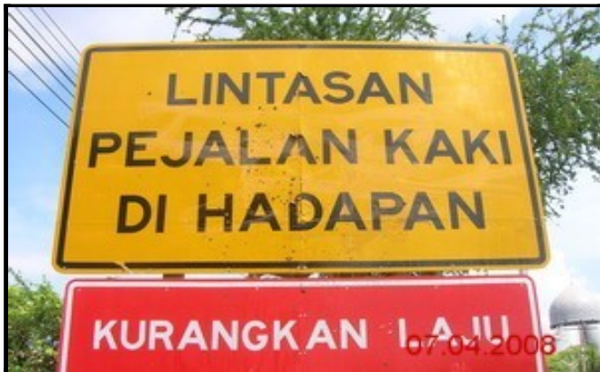
Film Batch : L4-08-006