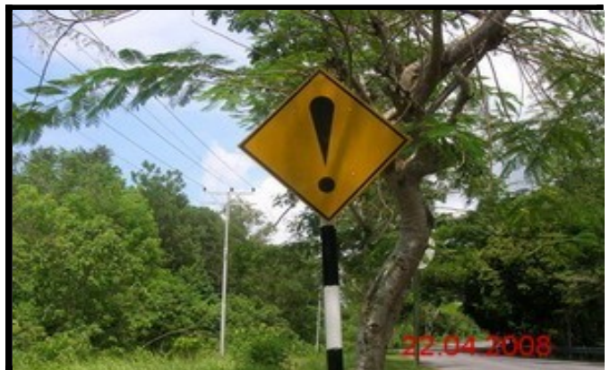
Film Batch : L4-08-057