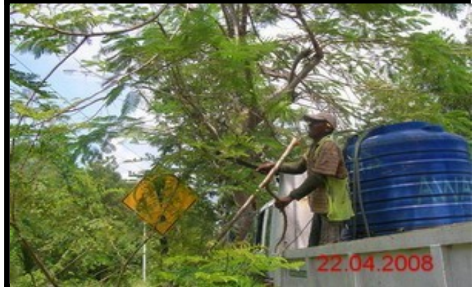
Film Batch : L4-08-044