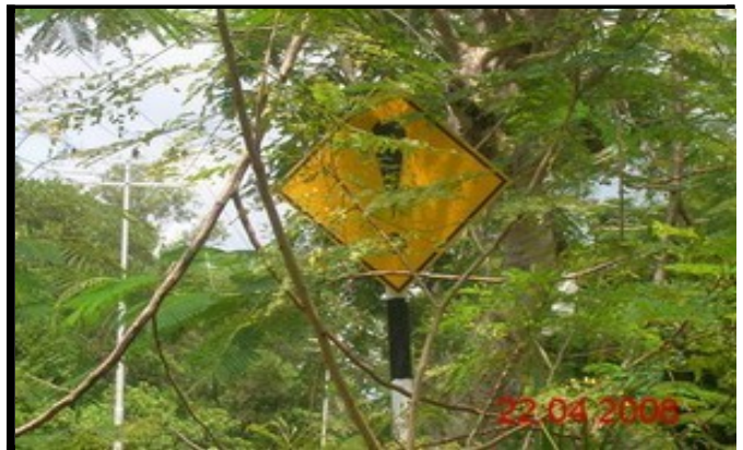
Film Batch : L4-08-042