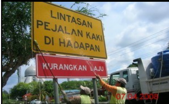
Film Batch : L4-08-010