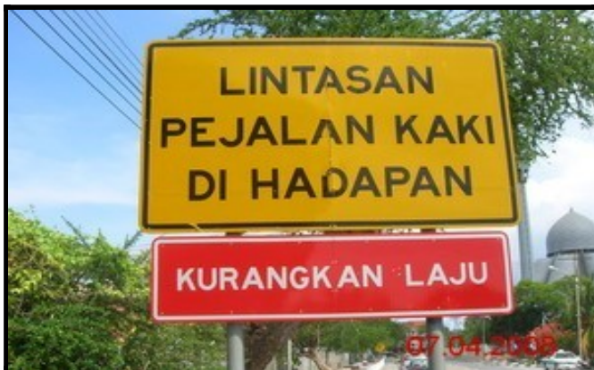
Film Batch : L4-08-015