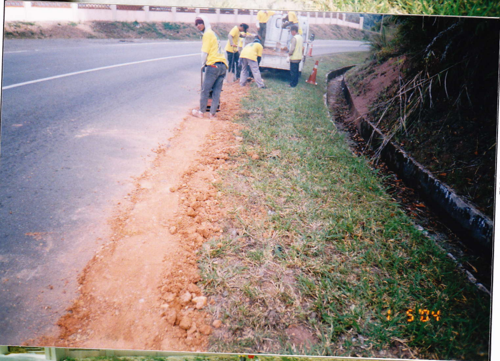
FILM BATCH NO: 0435/3