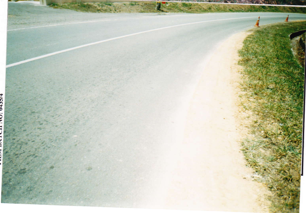
FILM BATCH NO: 0435/4