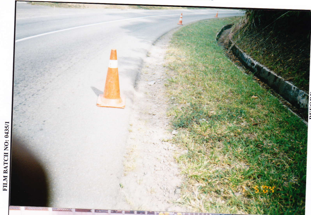
FILM BATCH NO: 0435/1