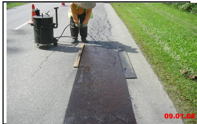
I N P R O G R E S S