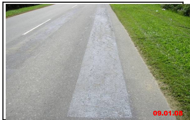
A F T E R