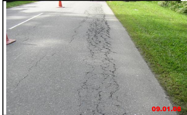
B E F O R E