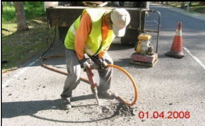
Film Batch : L5-02-090