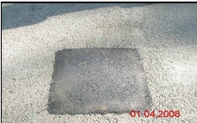
Film Batch : L5-02-116