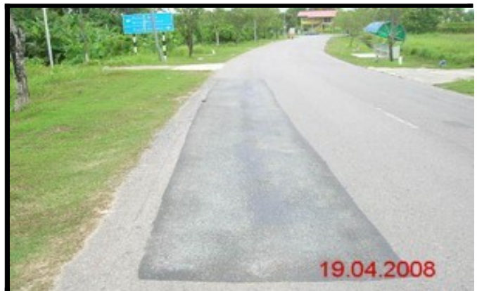
Film Batch : L3-14-189