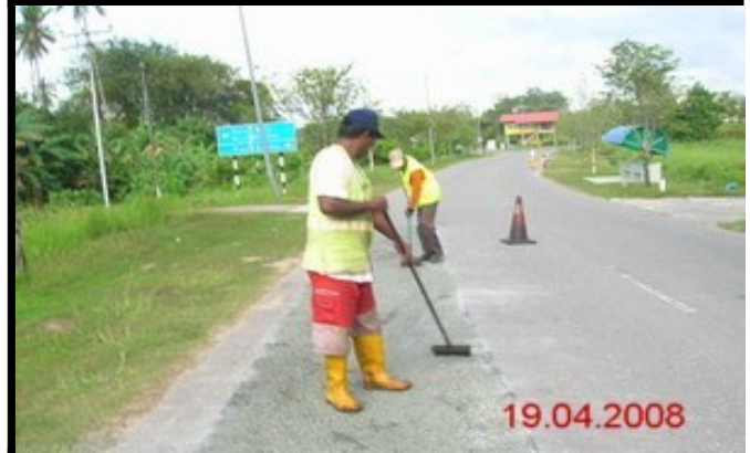
Film Batch : L3-13-140