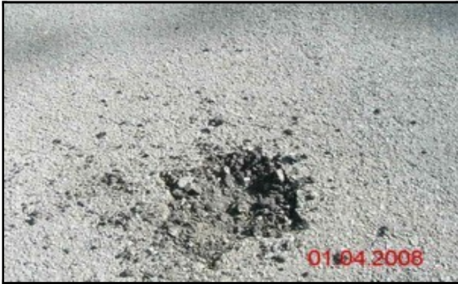
Film Batch : L5-02-089